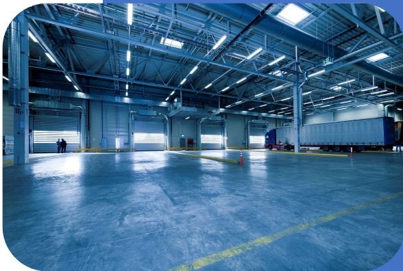
Logistics and Warehouses