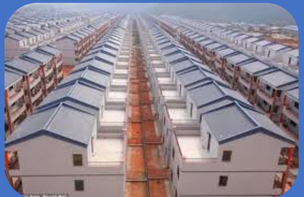
Urban, Rural and Industrial development